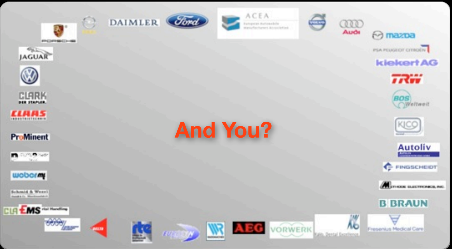
The logos of the companies are their property.